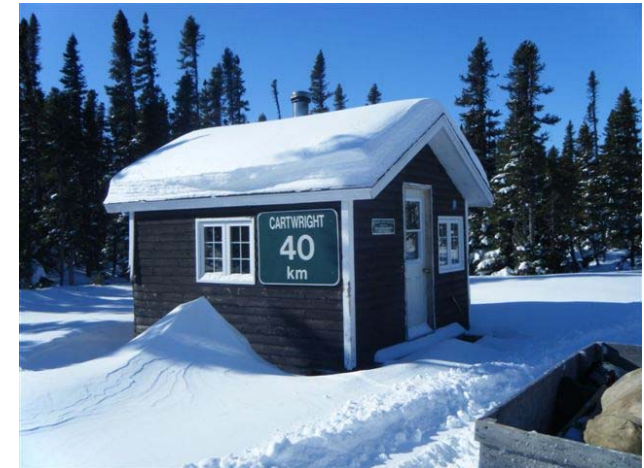
Rest station on snowmobile trail to Cartwright

2012 due to heavy ice conditions when marine service was not available. The budget for the 2011-12 fiscal year AFS was $230,000.