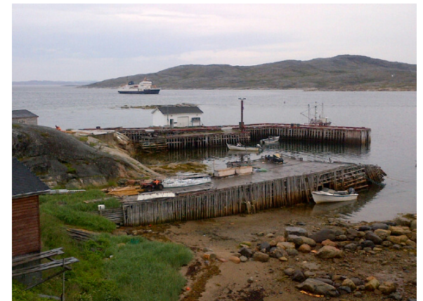
Northern Ranger entering Hopedale Harbour

the Center for Learning and Development and where appropriate other agencies to ensure effective and efficient delivery of training opportunities in Labrador. The committee assesses and identifies regional training needs and works to coordinate the development and delivery of training activities related to the identified needs.