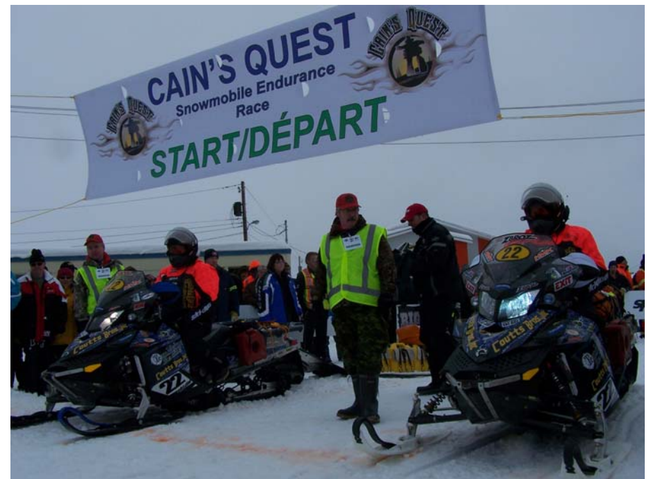
Cain's Quest Snowmobile race, Labrador City

The Labrador Affairs Office will report upon the objective and indicators in each of the next three years ending March 31, 2012, 2013 and 2014.