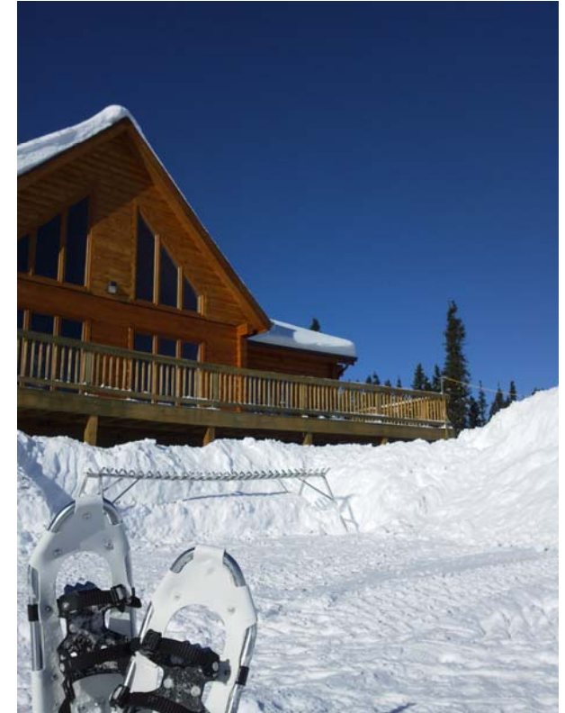
Birch Brook ski lodge

enhance the core development of the plan, as well as the social and economic growth of Labrador.